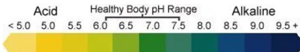
Fig. 2. pH scale of oral fluid

Neutral environment at pH=7; Acid one at pH<7; Alkaline one at pH>7.